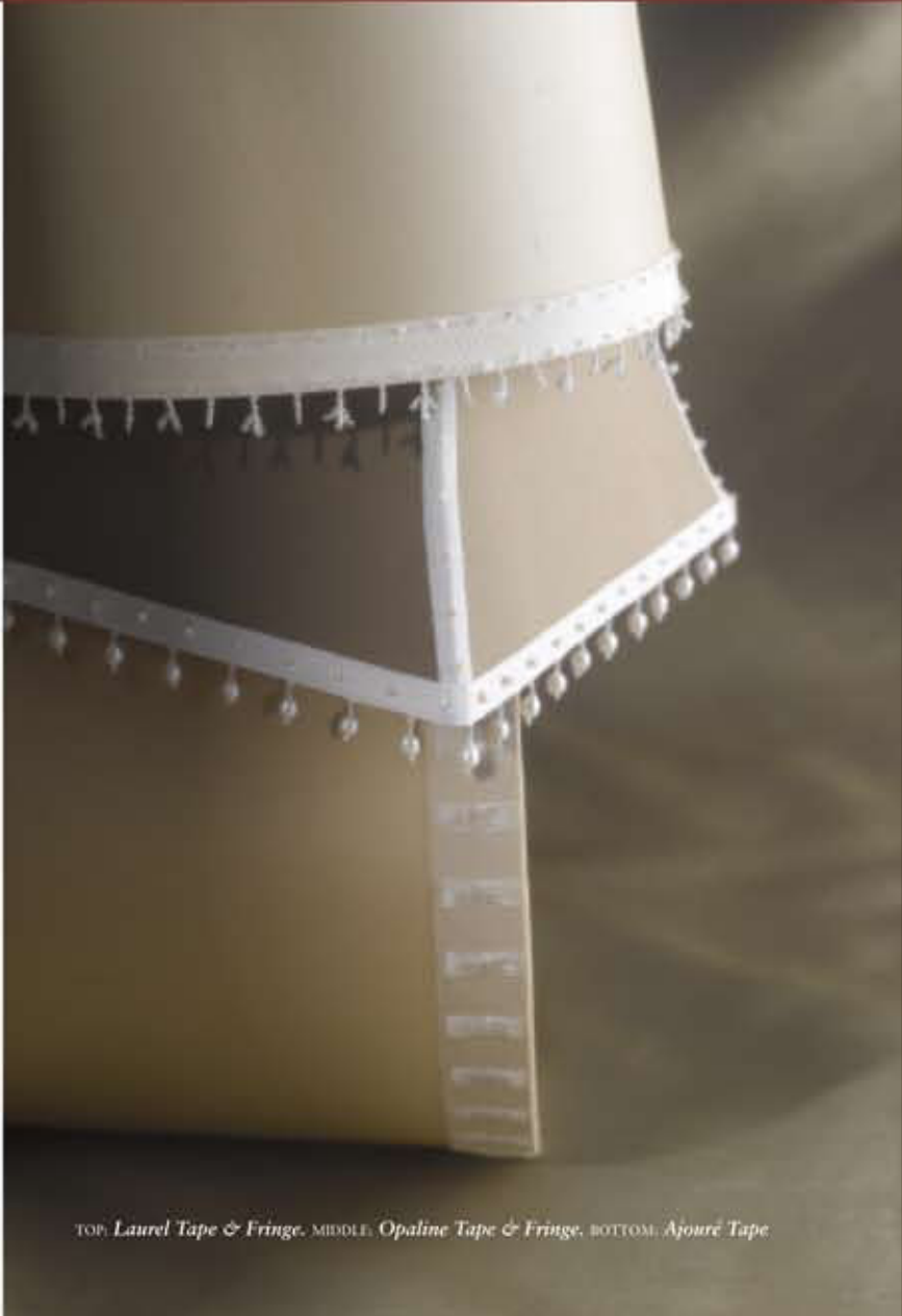
TOP: Laurel Tape & Fringe. MIDDLE: Opaline Tape & Fringe. BOTTOM: Ajouré Tape