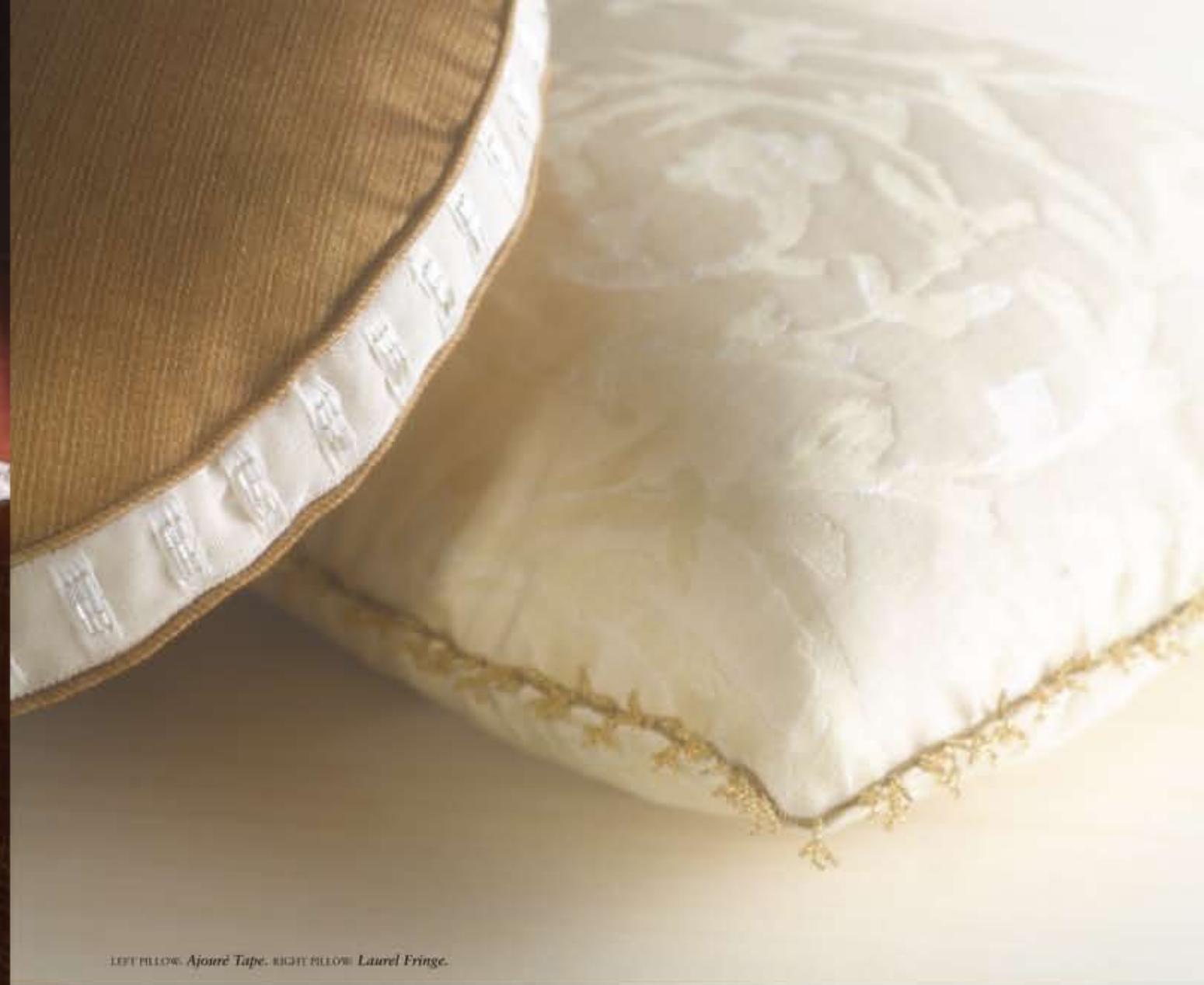
LEFT PILLOW: Ajouré Tape . RIGHT PILLOW: Laurel Fringe .