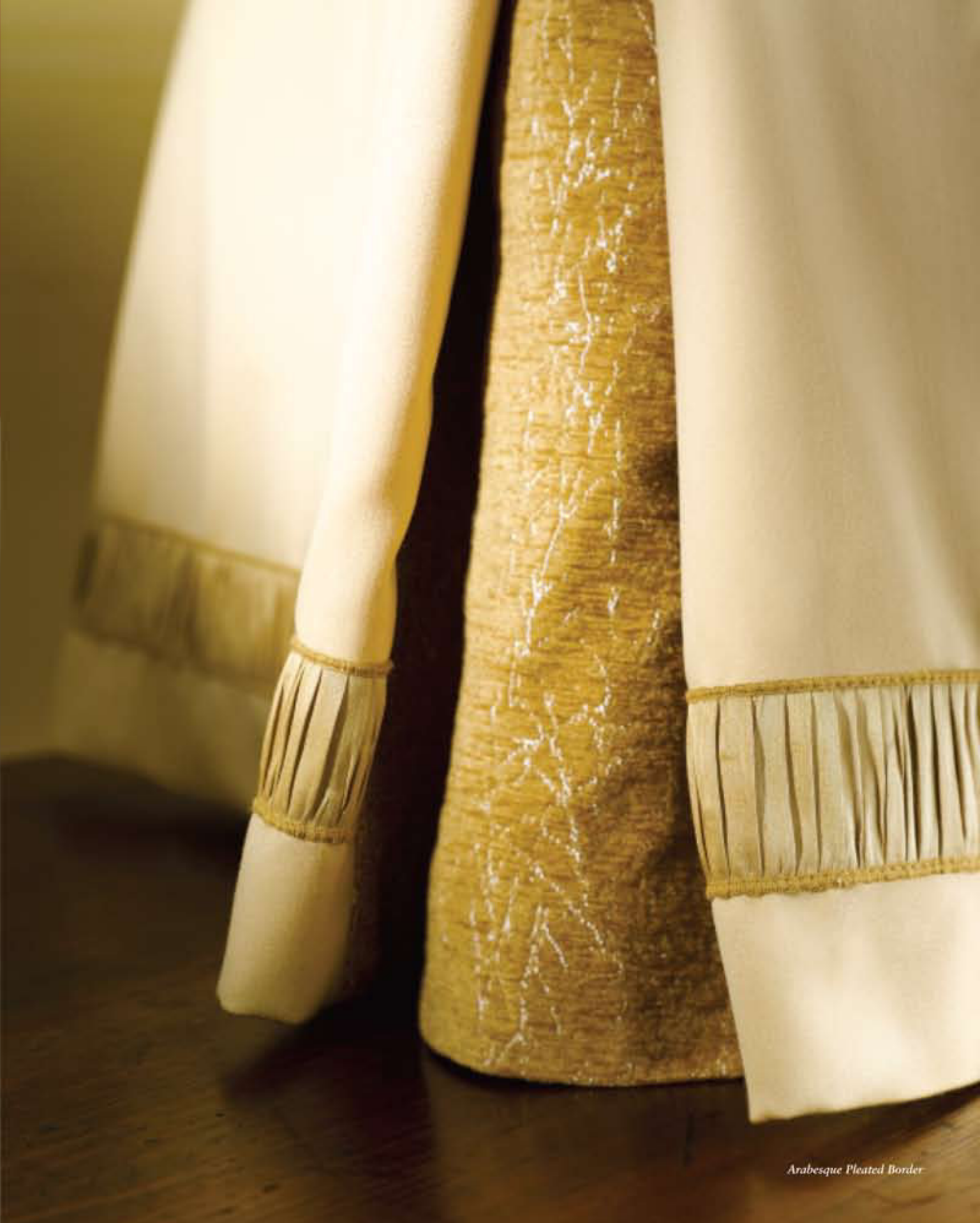
Arabesque Pleated Border