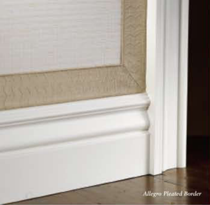
Allegro Pleated Border

The collection is discreet, feminine, luxurious and fanciful; “jewelry for interiors” that adds the final unique detail, the finishing touch.